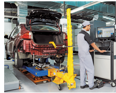
Frame alignment process