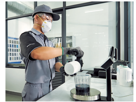
Paint mixing process