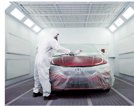
Spraying and drying facilities